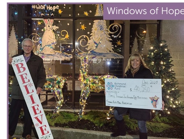
Windows of Hope