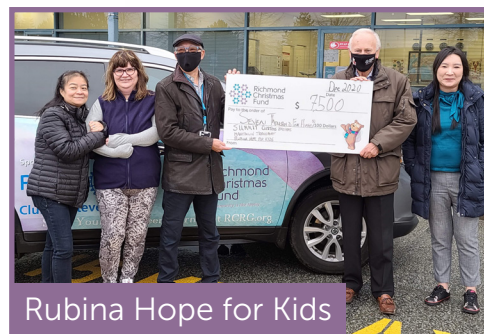
Rubina Hope for Kids